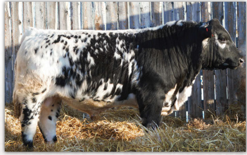
Green Hills 28A Fundamental 33F Full Brother to Lehr Ranch Lady 8D