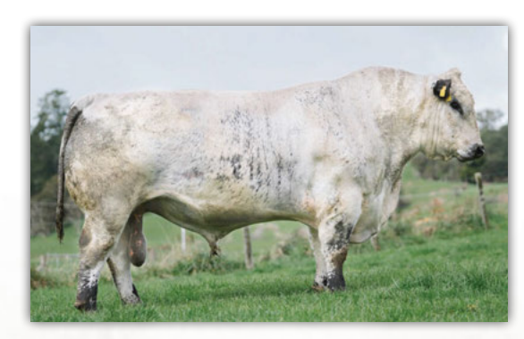
Premier 101Y Logic L11