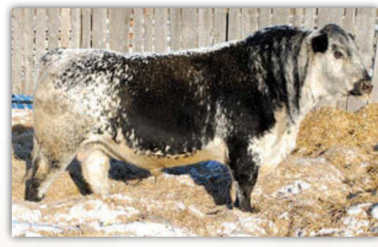
P.A.R. Moo Fassa 03M