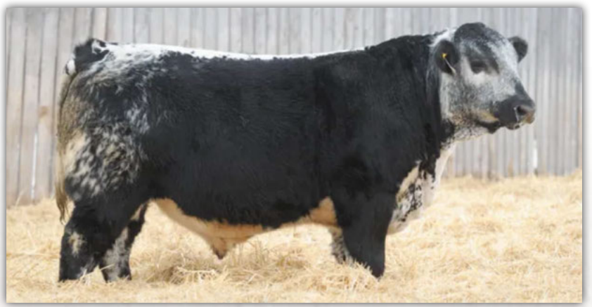
River Hill 60W Excalibur 345E Sire of Embryos