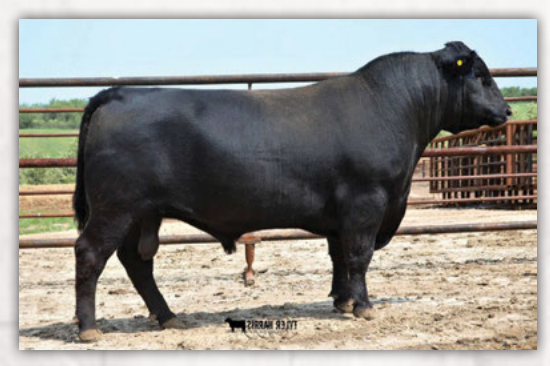
Spots N Sprouts Dusty 124D