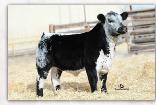
Six Star 82U Royal Flesh 101Y