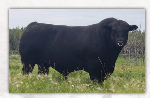
JSF Unmarked 2D