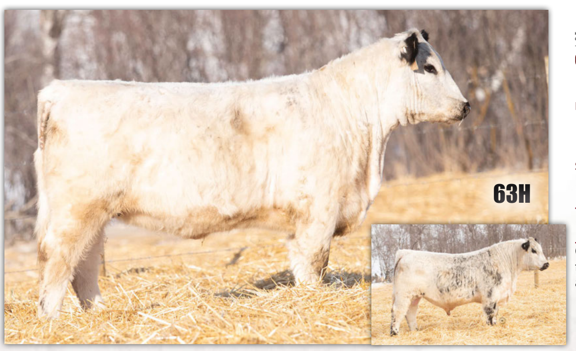
Full Sibling to Big Chill's 2020 Pick of the Bull Pen

Graceful, elegant, refined... these words barely begin to describe INC Gin & Tonic. This future momma cow has tremendous depth and capacity. 63H has a top on her as wide as a mall parking lot and she has tons of style. She's the next level of excellence.