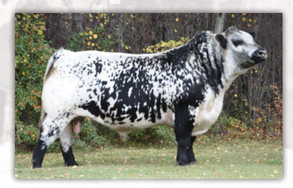
JSF Wall Street 36E