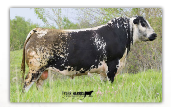
CAJA Zeppelin 1B