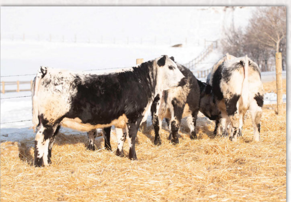
LEADING EDGE SPECKLE PARK SALE