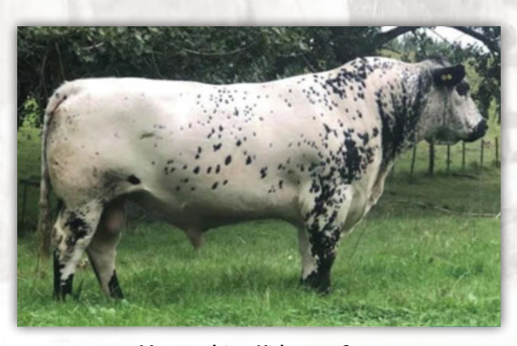
Maungahina Kidmans Cove