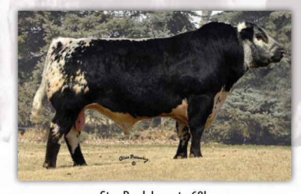
Star Bank Lacerta 68L